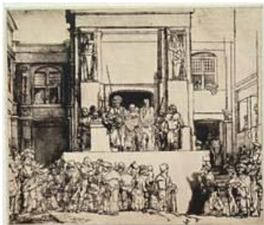
Christ Presented to the People, Rembrandt, Etching 1655

often when we make adjustments to a work of art we think of refining what is already there, adding highlights, sharpening contour lines, etc., but how often do we really look at our work and decide to edit out whole portions of the work? As you study the two prints ask yourself these questions: Why do you think Rembrandt made the choice of removing the group of people just below the focal point? How does this affect your participation as a viewer in the work of art? Which composition has a greater sense of drama? Rembrandt did many etchings of biblical scenes and his interpretation of them revealed his innate understanding of psychology, and his deep and profound respect for human dignity. He achieved this by his sensitive rendering as well as his thoughtful choices of what to include and what not to include in his compositions.