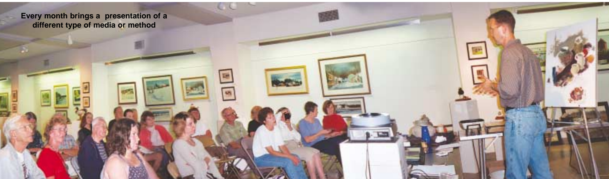
Every month brings a presentation of a different type of media or method

photographing artwork, critiquing artwork, and helpful suggestions on how to best promote and present your artwork.