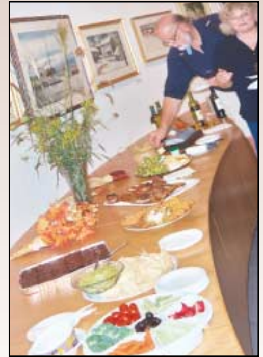
There's always refreshments at the meetings!

Nationally and locally known artists have given demonstrations and lectures at our meetings on topics such as watercolor, oil, and encaustic painting, political cartooning, courtroom illustration,