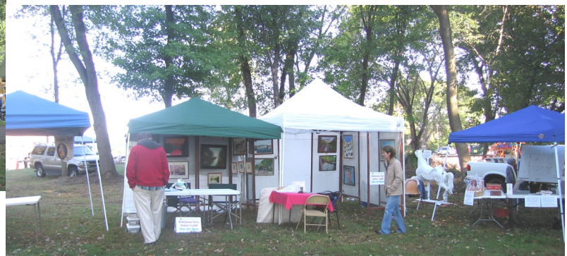
The PAAG tents at the River Festival manned and womanned by some dedicated PAAG volunteers!