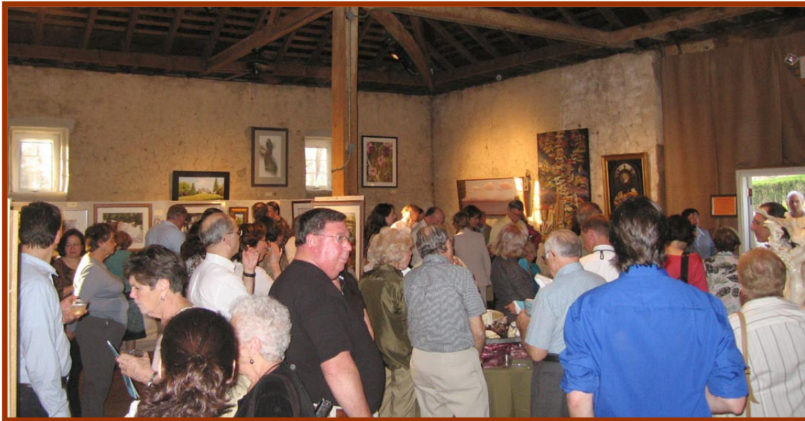
Several PAAG members were represented at April 18th opening at the John James Audubon Center at Mill Grove.