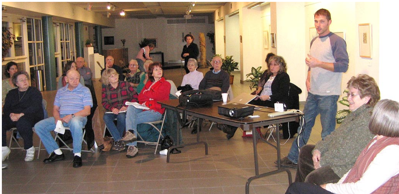
Chuck gave a captivating talk and slide show on the approach and method to his art.