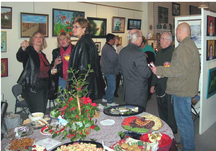
The food table, good guests and great art!