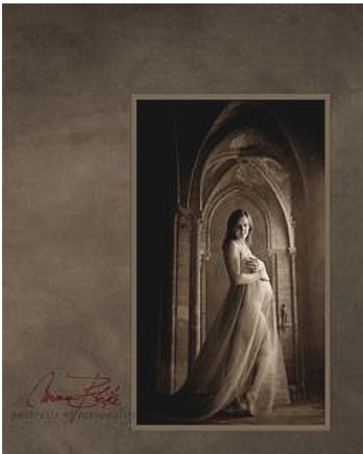
Lady In Waiting ©Carmen Blike