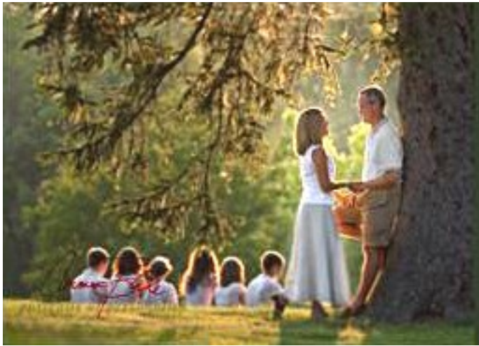
You're Still The One

Some examples of Carmen’s award winning photography.