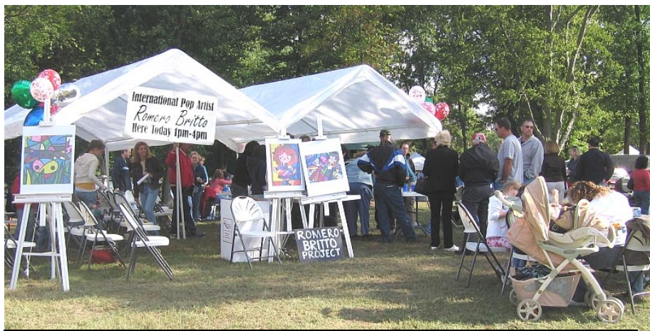
The Romero Britto tent at last year's (2007) Schuylkill River Festival. Check out Britto's website at www.britto.com

http://www.michenermuseum.org James A. Michener Museum