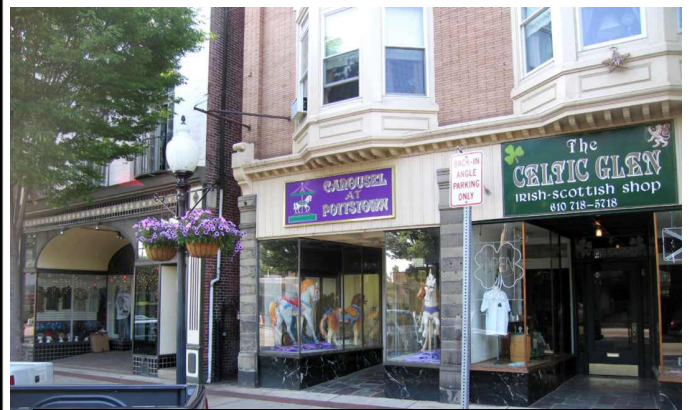
The Carousel Workshop is a few buildings East of Charlotte St. on the North side of High St. Parking is available in the Municipal Lot next to the Farmer's Market

The PAAG welcomes Elaine Bauer as our guest speaker for June.